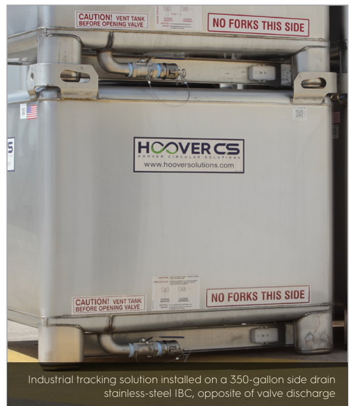
Industrial tracking solution installed on a 350-gallon side drain stainless-steel IBC, opposite of valve discharge