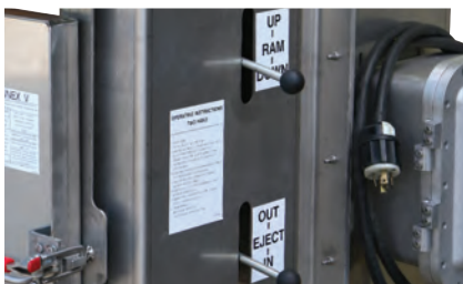
Two hands required for safe operation

Note: All measurements are rounded up to the nearest whole unit or decimal.