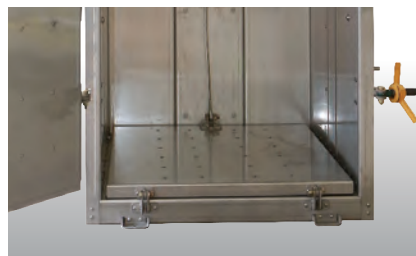
Eject feature: easy bag/bale removal